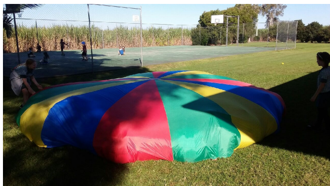
Children playing together during the lunch break

It was great to see so many people from the wider community coming along to support our school.